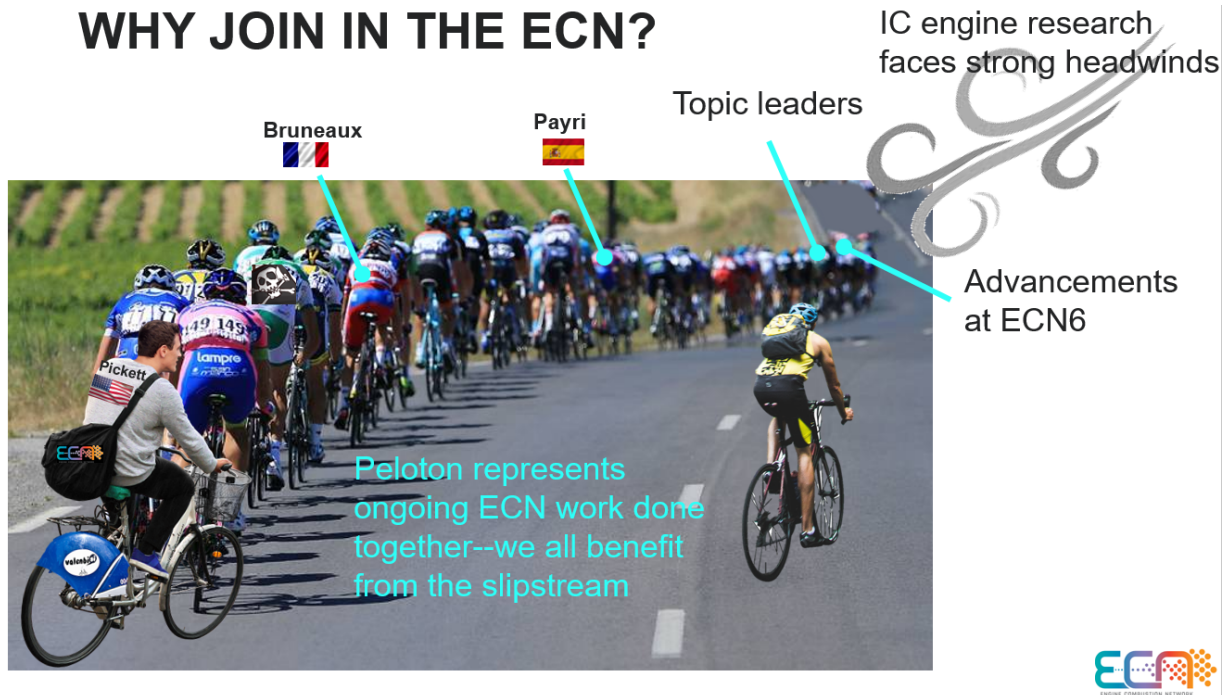
Figure 1. Main motivation to participate in ECN